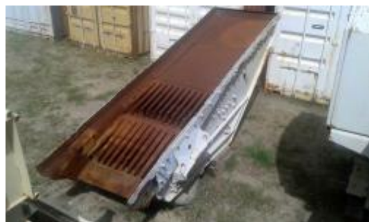
Complete Crusher Plant METSO C110 - HP-300 / 200 / 100