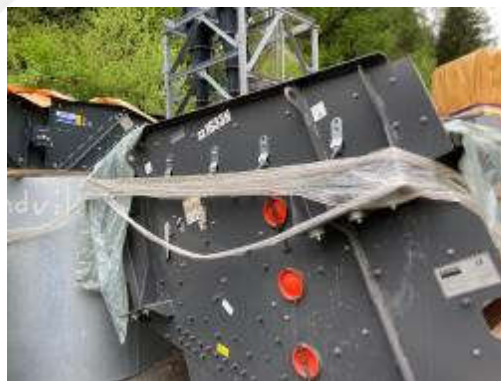
Complete Sandvik Sand Plant