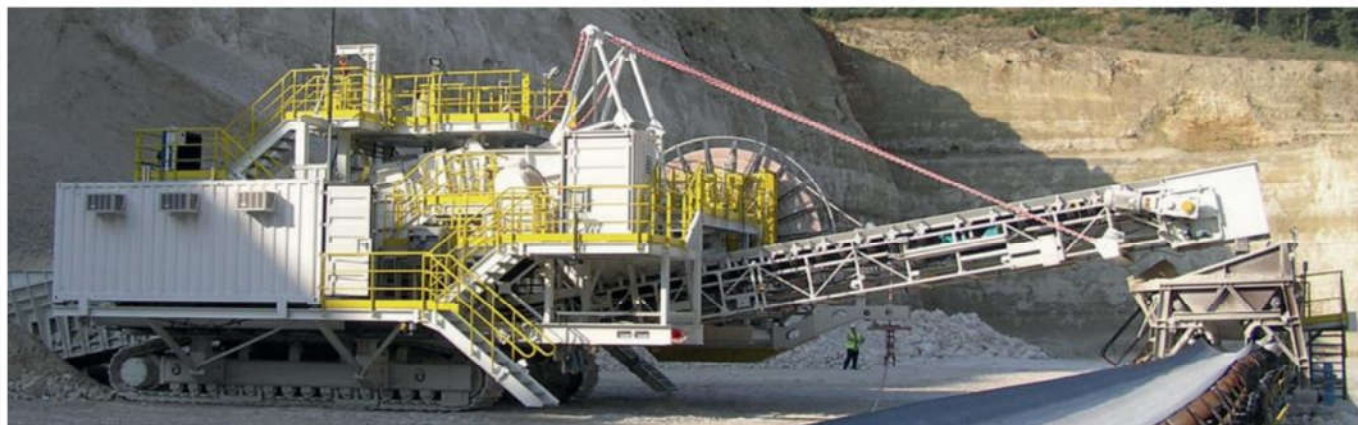
Example: Track-mounted Impact Roll Crusher