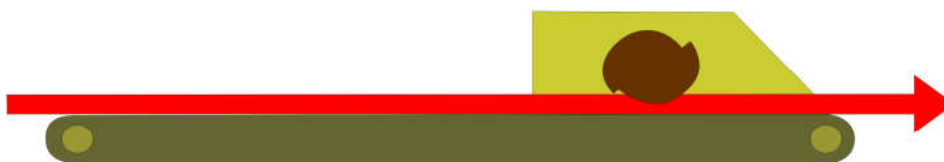
Impact roll crusher with horizontal material flow